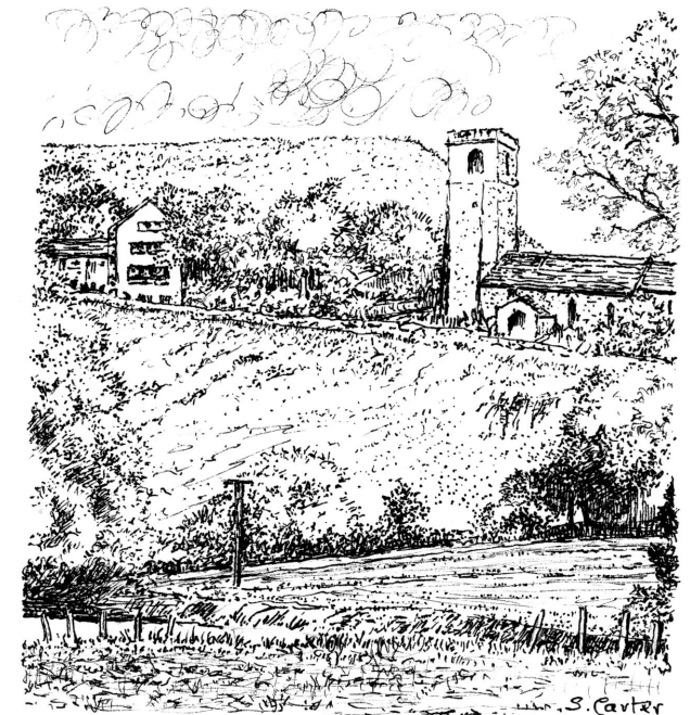
Great Mitton Hall and Church from the River Ribble.